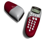
Qwizdom Interactive Training